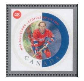
NHL AU Stary 3